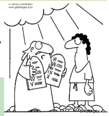
"I downloaded them from a cloud."

We are exploring the Beatitudes, specifically, experiencing the blessing of being peacemakers