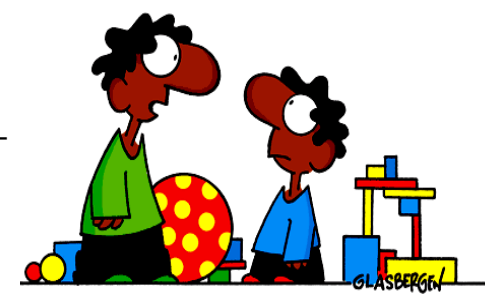
"I don't know all Ten Commandments. The only ones I remember are 'settle down', 'act your age' and 'take that out of your mouth'."

Easter is drawing closer. Memory Verse(s): Luke 22:19-20: "Then he took a piece of bread, gave thanks to God, broke it, and gave it to them, saying, 'This is my body, which is given for you. Do this in memory of me.' In the same way, he gave them the cup after the supper, saying, 'This cup is God's new covenant sealed with my blood, which is poured out for you.'