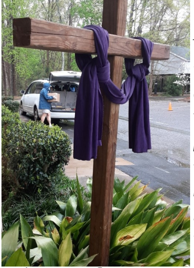
Jesus said, "You give them something to eat."