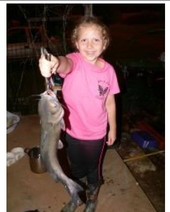
Who's Who? caught her first catfish in 2012. (look elsewhere in the Covenant-er for the answer)