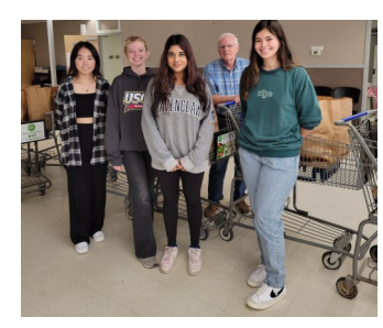
More of our food pantry volunteers!

For the month of October Food Pantry Volunteers and some of the UGA served 1,668 food insecure neighbors. Of that 318 were children, 275 were over 65. Thank you Covenant and May We All Have Enough!