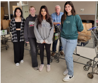
More of our food pantry volunteers!