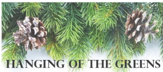
HANGING OF THE GREENS

Hanging of the Greens — Sunday, November 24 following worship. We will enjoy a light soup lunch and decorate the fellowship hall for Christmas inside and out. Please become apart of the team. Many hands make light work. Your help will be a gift to us all.